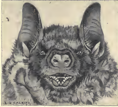
FIG. LXXII. BRACHYPHYLLA NANA. DWARF NOSE-LEAF BAT.